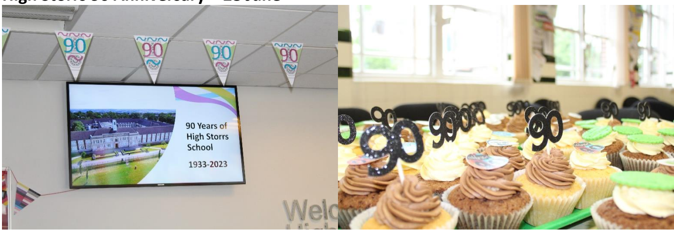
High Storrs 90 Anniversary - 28 June

Not all the events from these past months feature in this photo blog. For example, we have had two Proms - Y11 and Y13 - and other trips and visits such as Y12 Art trip to London. We also have Sports Day and Celebration assemblies this week. However, we hope this gives you a 'flavour' of summer at HSS.